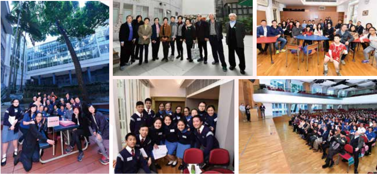
Table Tennis Tournament for Alumni

The annual Alumni Homecoming Day on 9 December gathered around 300 alumni from Classes of 1963, 1973, 1978, 1988, 1993, 1998, 2008 and 2013. The next Homecoming Day is scheduled for 8 December 2018. Classes whose graduating years ending in "4" or "9" and also those classes ending in "3" or "8" who missed the 2017 event are welcome. We also welcome overseas alumni who will be in Hong Kong on that day to join in the fun. Please contact your Class Representatives or Community Relations Office at (852) 2523 0087 or email to spcc-tc@spcc.edu.hk for registration and information.