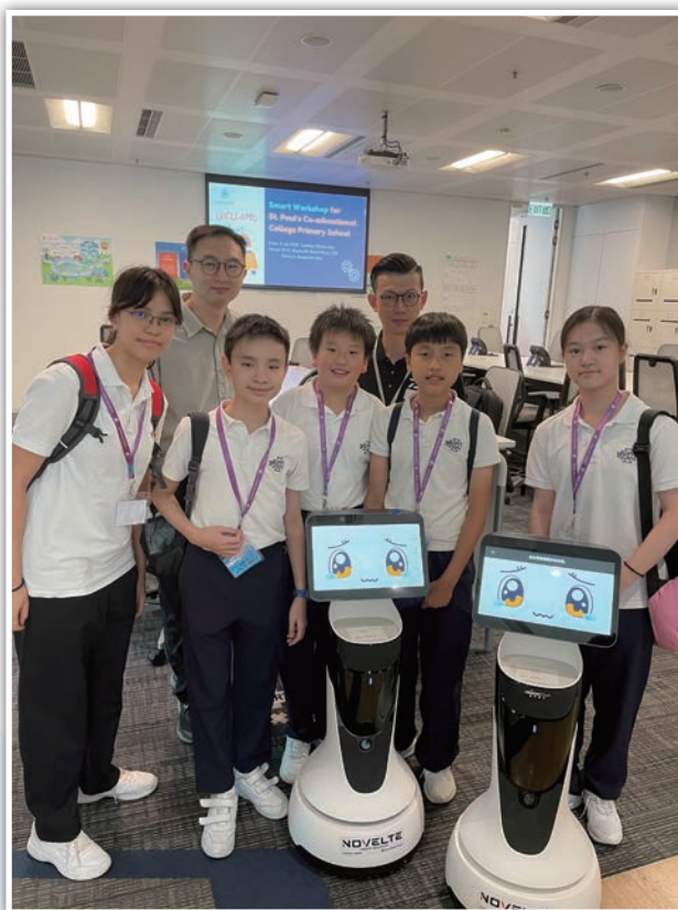
在 Computime 職員指導下，體驗科技任務：利用編程知識令機械人按指示行進。

在這次「香港科技與城市發展」之旅，我們到了 Computime 金寶通集團有限公司參觀，當中的各種體驗，真的讓我大開眼界。我們利用人工智能體驗如何建造一個智能家居，更有機會嘗試以定位技術設定機械人，了解送餐機械人的運作原理。