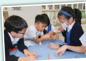
我們相信三角形是最穩固的形狀。

我們於6月底在高低實驗室內進行了常識科的科探工作坊，任務就是要建造一個抗地震塔。我和三位同學一起商量後，就開始動手製作了。首先，我們用膠紙固定數條乾意粉條並堆砌成一個塔，然後把一包紙巾放在塔頂上，再把乾意粉塔放在地震模擬器上，看看在地震模擬器震動時紙巾會否掉下，塔會否倒塌。為了優化我們的實驗品，我們在塔頂增加了一條橫放的乾意粉條，用來承托紙巾。最後，我們把製作好的乾意粉塔放在地震模擬器上，在模擬器震動超過十秒後，紙巾仍然沒有掉下來，說明我們製作的抗地震塔成功了！我們高興得手舞足蹈。我每次看到這份實驗品，都有滿滿的成就感。我希望將來可多參加這些既動腦筋又有意義的活動。