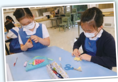
同學們認真地製作紙花。

便能像有生命一樣的開花，真是神奇。老師說這是毛細現象 (capillary action)，因為紙張是由植物纖維組成的，吸水後便會發脹和改變形狀而形成慢慢開花的效果。我真的很喜歡這個既漂亮又實用的科學實驗呢！我一定會和家人