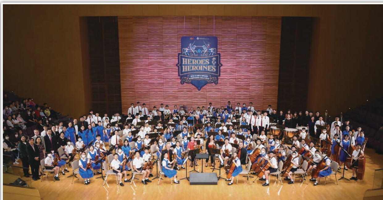
London Mozart Players 與中小學樂隊於音樂會大合照。