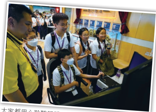
大家都用心聆聽輕鐵職員指示，嘗試控制列車，體驗車長工作。

首日行程由香港大型基建設施開始，同學在青嶼幹線觀景台遠眺青馬大橋、汲水門大橋和汀九橋等多項大型交通基建，再經過近年開通的屯赤隧道，體驗道路建設對香港市民出行便利的重要性。