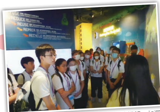
同學透過賽馬會氣候變化博物館導賞員的講解，加深對環境保護的關注。

同學接著參觀全球第一所以氣候變化為主題，位於香港中文大學的賽馬會氣候博物館，了解科技在環境管理和監測氣候變化的重要性。在參觀中提升了同學對氣候變化的關注，期望可啟發他們為香港以至國際社會應對氣候變化作出貢獻。