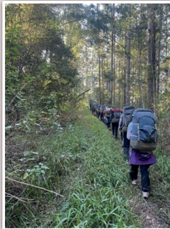
Snapshot of Form 6 cohort