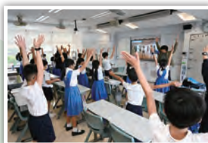
老師帶領著同學一起做護脊操。