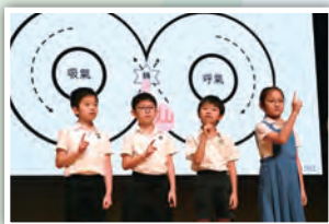
同學上台示範「8字呼吸法」

學校一向持續推行正向教育，「性格強項」(character strength)是正向教育的基礎理念，相信每個人與生俱來都有不同的良好特質。為鼓勵學生多認識和運用自己的「性格強項」，德育組安排小五及小六學生利用成長課完成有關性格強項的問卷，而小一至小四學生則由家長協助在家完成問卷。未來，學校會參考學生性格強項的數據，為同學設計一系列有關發揮性格強項的培育活動，從而增強學生的自信心，並具備互相欣賞的正面思維。