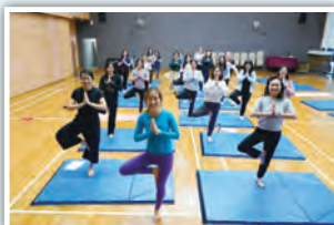
張校長和老師們參加瑜珈班，一起練習不同的基本體位法及呼吸法，舒緩肌肉緊張，平靜心境。

2024年12月4日下午教師發展日舉辦各項興趣班，由聖雅各福群會 Wellness Pro 導師到校帶領各項活動，包括：K-Pop 跳舞班、瑜伽體驗班、香薰擴香石DIY及茶藝養生班。體育組亦帶領老師們進行球類比賽活動，強身健體。教師自選參加喜愛的活動，盡情享受一個愉快的下午，舒緩精神壓力，增加正能量！