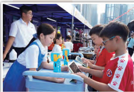
同學們很喜愛我們的MARTY