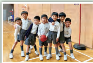
好朋友一起打球特別開心！