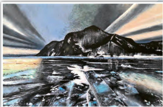
The Colours of Lake Baikal | Acrylic on canvas

At the break of dawn, spears of light radiate from the horizon in colours of the rainbow, as the vast lake beneath the splintered ice reclines illuminated. This scenery in far eastern Russia, secluded in a never-ending expanse of taiga, now lies immortalised on my canvas, a testament to nature's timeless beauty. May the breathtaking scenery of Lake Baikal stay forever undisturbed amid the looming threat of climate change. May its calm, picturesque waters be frozen in time forevermore.