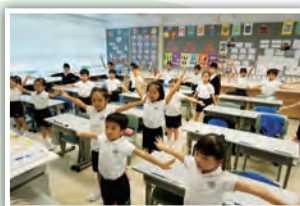
我們要多做運動來保持身心健康呢！

學生支援組在2024年11月4日舉行「精神健康日」，除了教導學生怎樣辨識自己的壓力警號，更有同學上台帶領全校師生一起進行「8字呼吸法」，在其後的成長課上，同學都會不定期進行放鬆呼吸，以實際行動來減壓，笑對逆境。