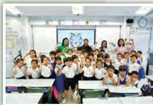
校長也和我們一起做護脊操！