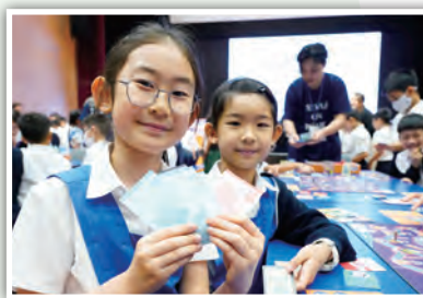
小三同學正在參與「金管局《Smart理財321》桌上遊戲體驗活動」