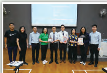
天主教領島學校李校長及團隊到校分享推行資訊科技的校本經驗。