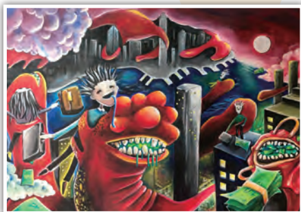
Greed | Acrylic on canvas

I have once read such a line from Mahatma Gandhi, "The earth has enough for every man's need, but not every man's greed." In today's society where materialism and capitalism dominate, many people have lost their identities entitling themselves to constant overworking and money making. Many are unconscious that they have been entrapped by human greed and desires, thus missing out on the greatest moments of life like family and friends.