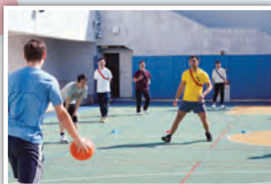
體育組帶領老師們進行閃避球比賽，大家都充滿活力，發揮運動潛能。