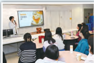
中醫師向老師們講解如何透過沖茶的過程放慢腳步，體驗一杯熱茶對生活的療愈作用。