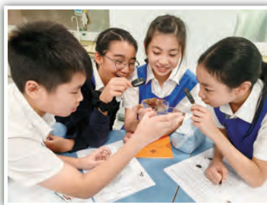
小六同學正在觀察蝸牛的身體結構。

在科學科和人文科獨立成科的發展路上，我們將不斷優化兩科的教學策略，讓我們的學生能在這兩科的學習上，各展所長，綻放光芒。